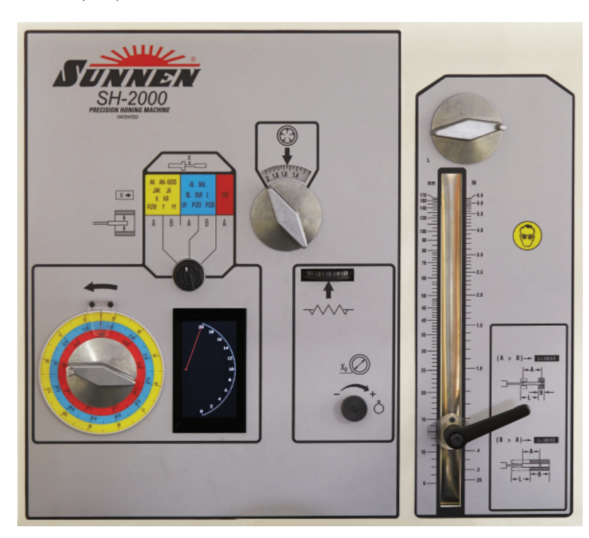
Up close features on the SH-2000

Sensing probes are adjustable so you can set size exactly where you want it – high, low or in the middle of your tolerance range. You can use the same sensing probe for rough and finish honing. Use with optional Automatic Size Control (ASC).